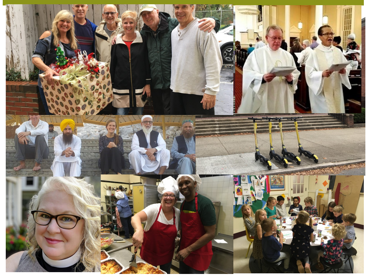
St. Mark's Episcopal Church Annual Meeting January 26, 2020